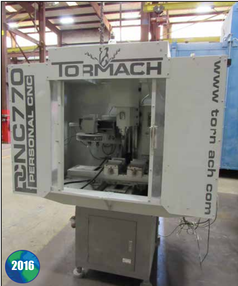
TORMACH CNC MILLING MACHINE