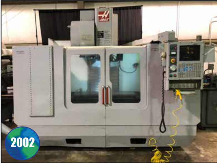
HAAS VF-3B CNC VERTICAL MACHINING CENTER