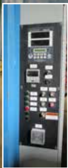
WISCONSIN BATCH CURING OVEN