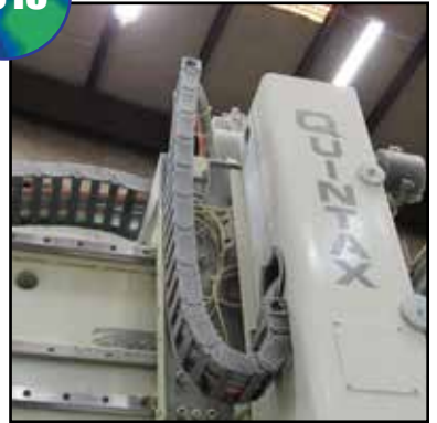
QUINTAX 5-AXIS CNC GANTRY ROUTER