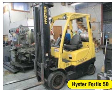
Hyster Fortis 50

Inspection: Tuesday, March 5, 2013, 8:00 am to 4:00 pm