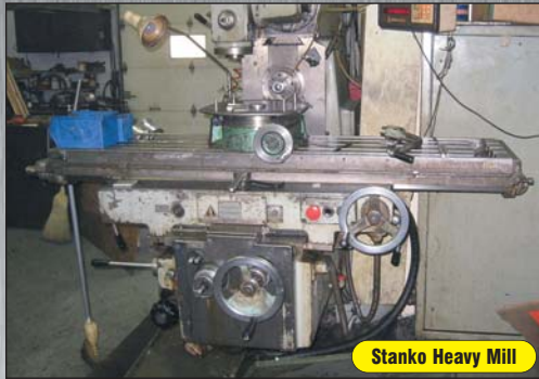
Stanko Heavy Mill

Friday, March 1 to Wednesday, March 6, 2013