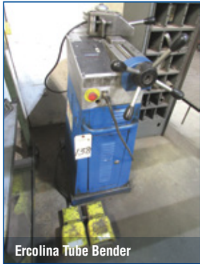
Ercolina Tube Bender