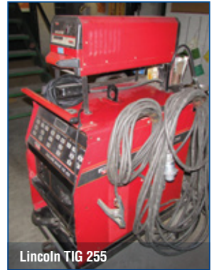
Lincoln TIG 255