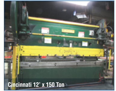
Cincinnati 12' x 150 Ton