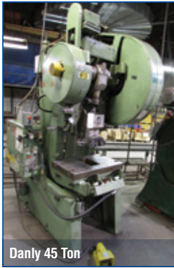
Danly 45 Ton

5,000 lb Capacity Pallet Trucks, 100 Wire Stacking Bins, Warehouse Pallet Racking, Assorted Steel Stock Bins and Approximately 100 Steel Stacking Skids, Acme Sivaron Model SS904 Auto Strapper, S/N 83379118 mounted on Blue Giant Lift