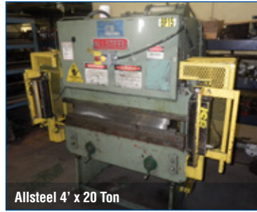
Allsteel 4' x 20 Ton