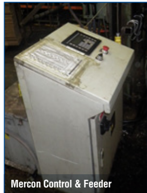
Mercon Control & Feeder