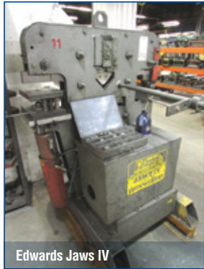
Edwards Jaws IV