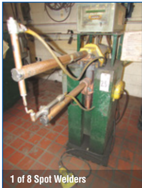
1 of 8 Spot Welders