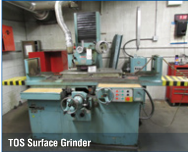
TOS Surface Grinder