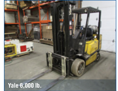
Yale 6,000 lb.