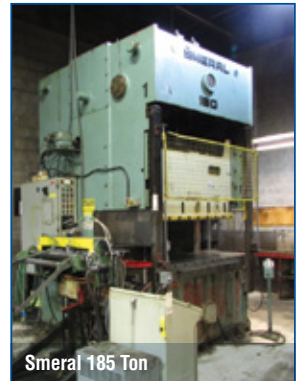
Smeral 185 Ton