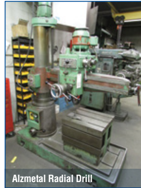
Alzmetal Radial Drill