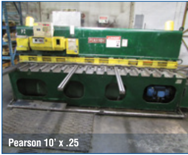
Pearson 10' x .25