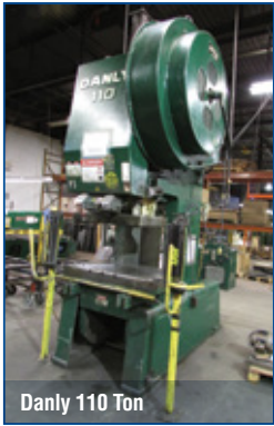
Danly 110 Ton