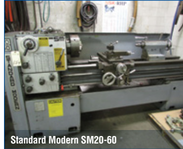
Standard Modern SM20-60