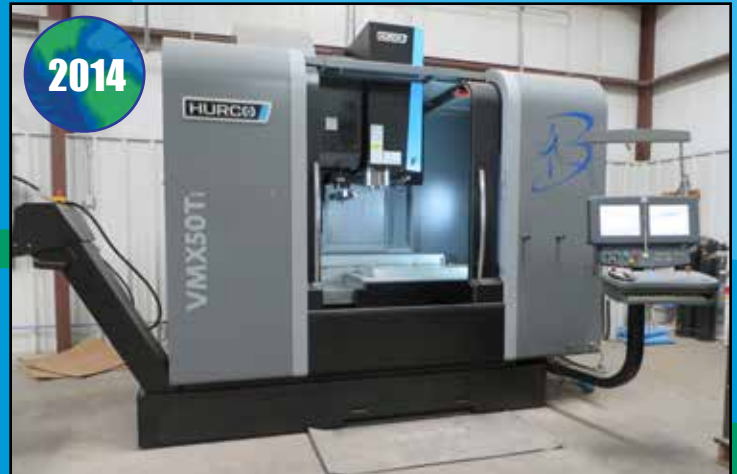
HURCO VMX50T 3-AXIS CNC VERTICAL MACHINING CENTER