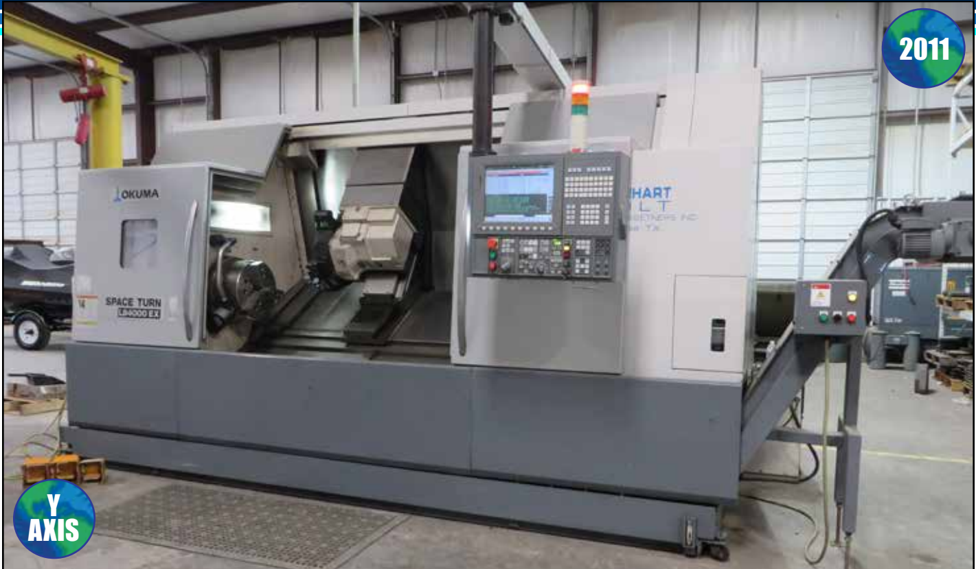
OKUMA SPACE TURN LB4000EX-MY C1500 CNC TURNING CENTER WITH Y-AXIS, MILLING & C-AXIS