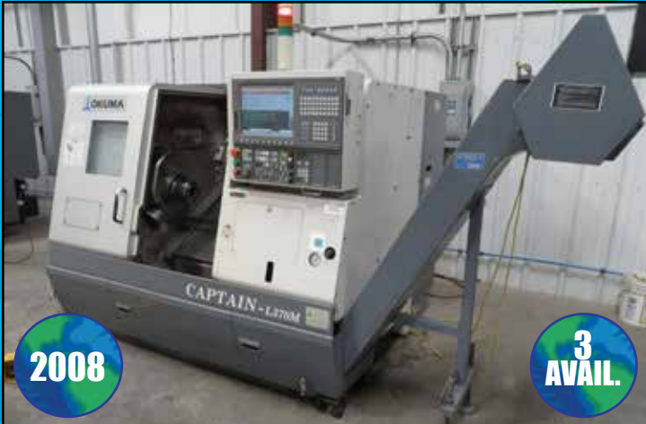
OKUMA CAPTAIN L370M & L370 CNC TURNING CENTER