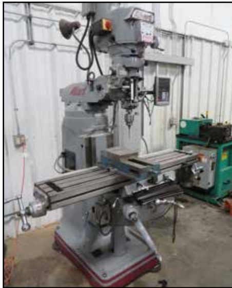
ALLIANT 94903V VARIABLE SPEED KNEE MILL