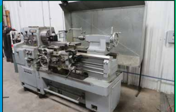
MORI SEIKI 17" X 32" HEAVY DUTY ENGINE LATHE