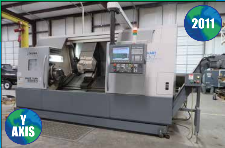
OKUMA SPACE TURN LB4000EX-MY C1500 CNC TURNING CENTER

Inspection: Wednesday, August 23rd, From 8:00 A.M. - 4:00 P.M. CDT