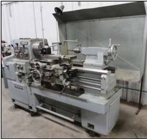
MORI SEIKI 17" X 32" HEAVY DUTY ENGINE LATHE