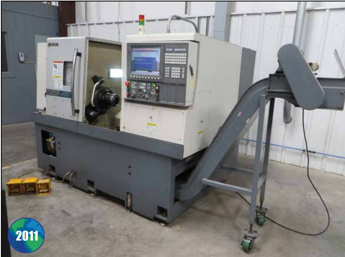
OKUMA GENOS L400 2-AXIS CNC TURNING CENTER