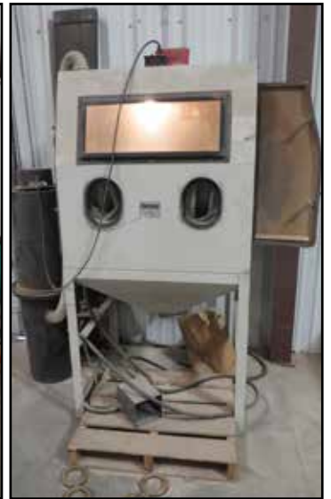
CYCLONE ABRASIVES BLAST CABINET