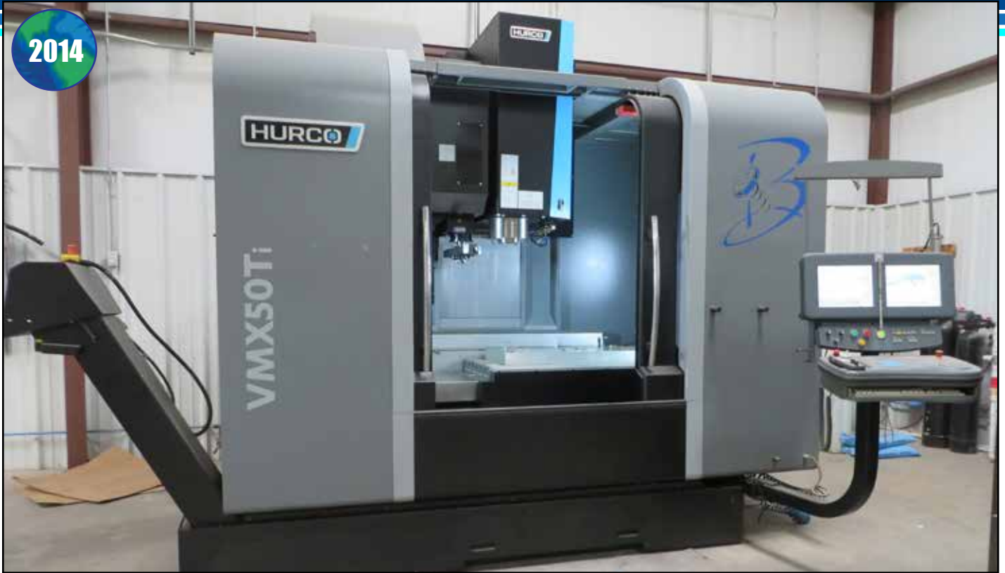
HURCO VMX50-Ti/50T 3-AXIS CNC VERTICAL MACHINING CENTER