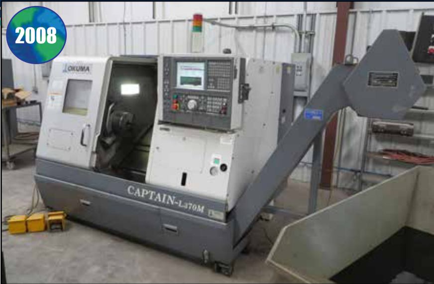
OKUMA CAPTAIN L370M CNC TURNING CENTER WITH MILLING, 'C' AXIS