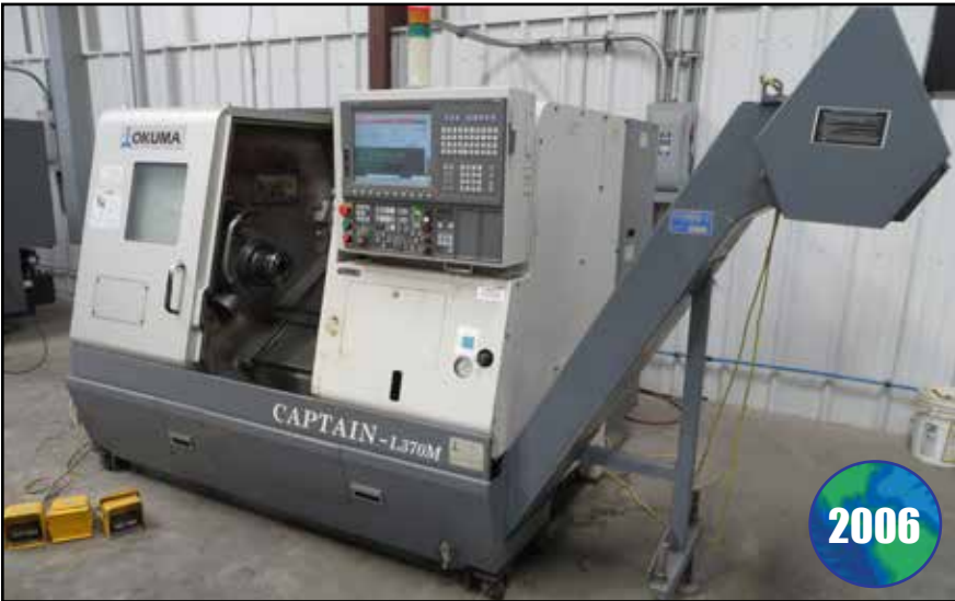
OKUMA CAPTAIN L370M CNC TURNING CENTER WITH MILLING, 'C' AXIS

(6) Live Tools: (2) Right Angle, (2) Straight, (2) Universal (for LB4400 EX), Numerous Other Live & Static Tool Holders for All OKUMA Turning Centers