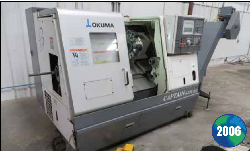
OKUMA CAPTAIN L370 2-AXIS CNC TURNING CENTER