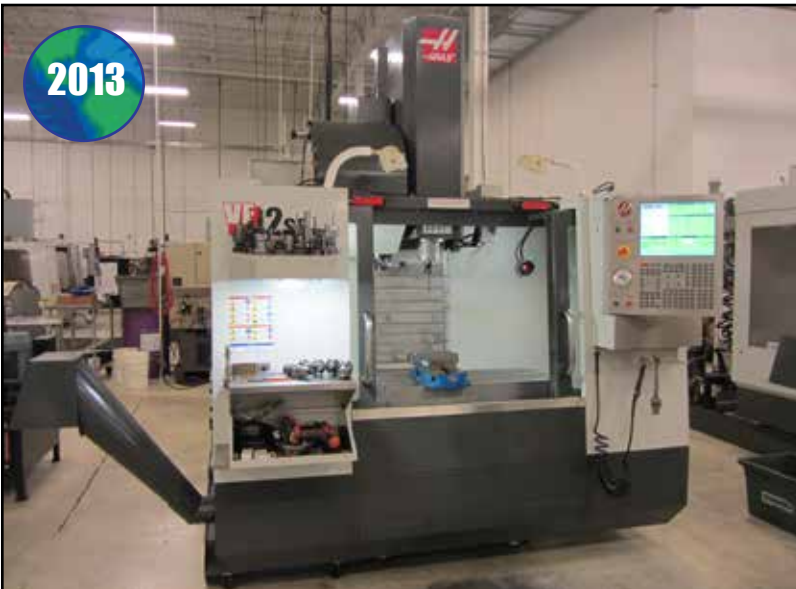
HAAS VF-2SS SUPER SPEED CNC VERTICAL MACHINING CENTER