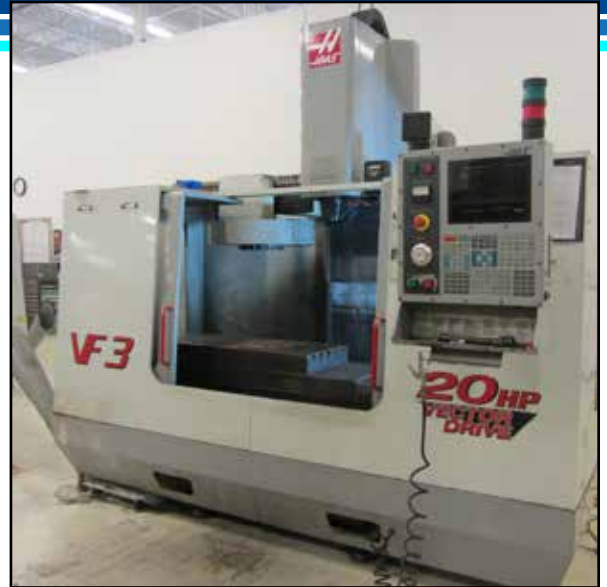
HAAS VF-3B CNC VERTICAL MACHINING CENTER