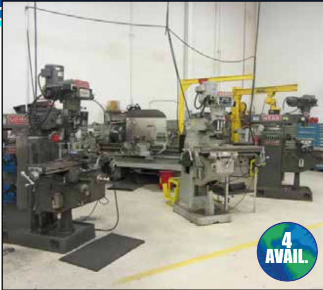
(4) WEBB 4VH / JTM1 VARIABLE SPEED VERTICAL KNEE MILLS