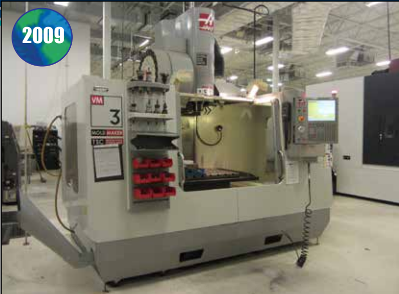
HAAS VM-3 MOLD MAKER CNC VERTICAL MACHINING CENTER