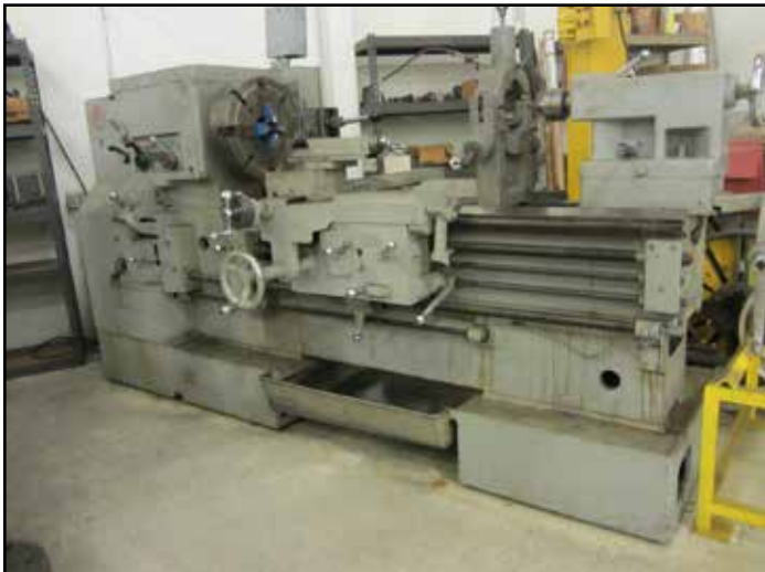
LEBLOND REGAL SLIDING GAP BED LATHE

PEMSERTER Series 4 6-Ton Insertion Press with 18" Throat, QX4 Turret Tool System & Cabinet Base, sn:5313, mfg.2011