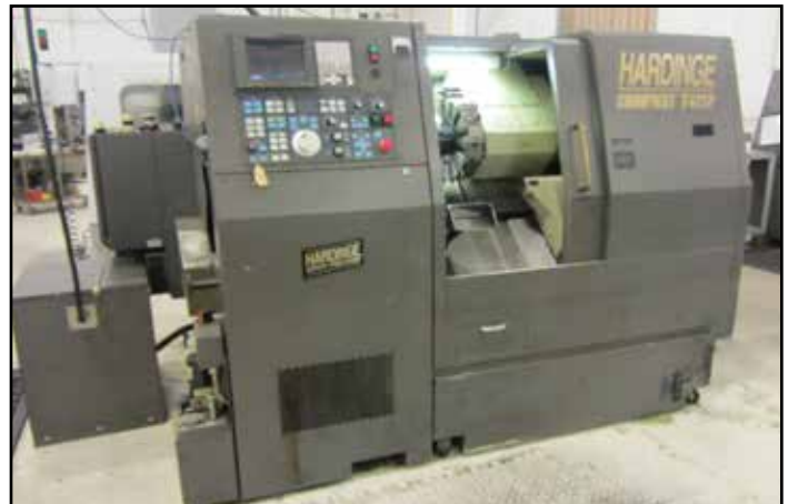
HARDINGE CONQUEST T42SP CNC TURNING CENTER