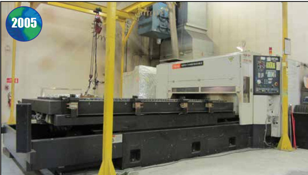
MAZAK 4000 WATT CNC LASER, SUPER TURBO X510 MARK II