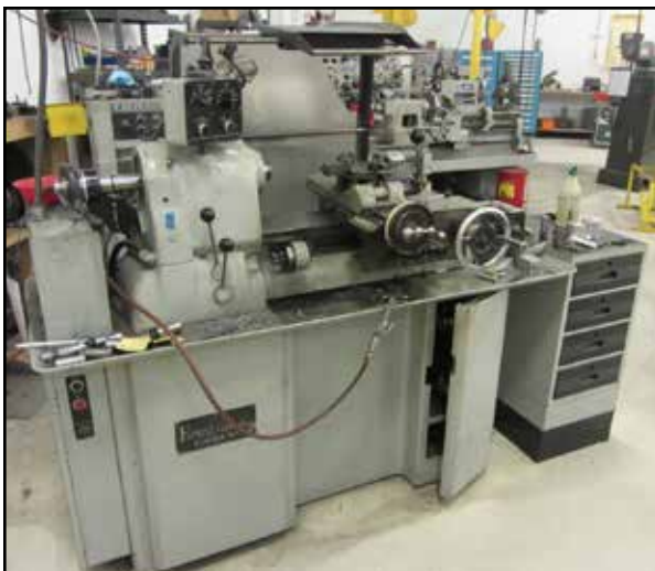
HARDINGE HC TURRET LATHE