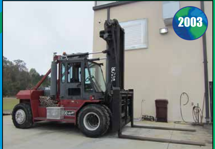
TAYLOR T-300M 30,000LB CAPACITY FORKLIFT