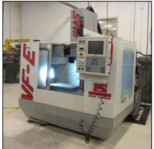
HAAS VF-E VERTICAL MACHINING CENTER