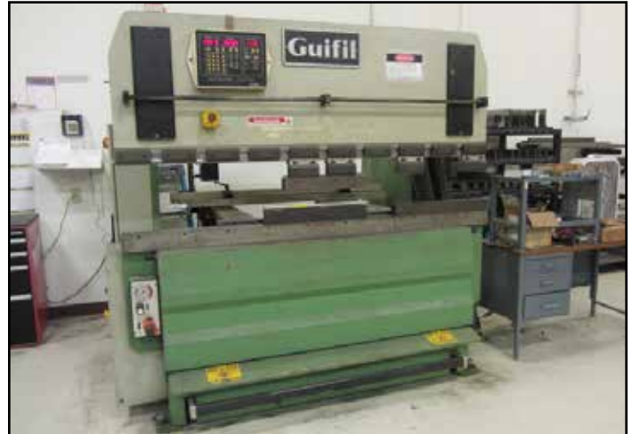
GUIFIL 69 TON X 6'4" HYDRAULIC PRESS BRAKE