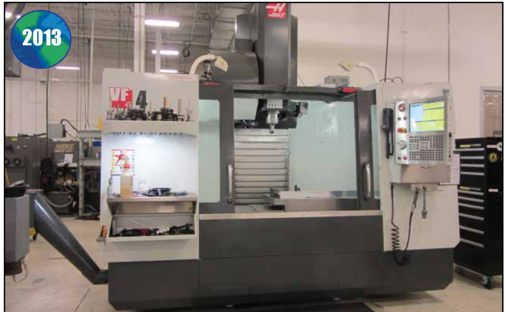
HAAS VF-4 CNC VERTICAL MACHINING CENTER