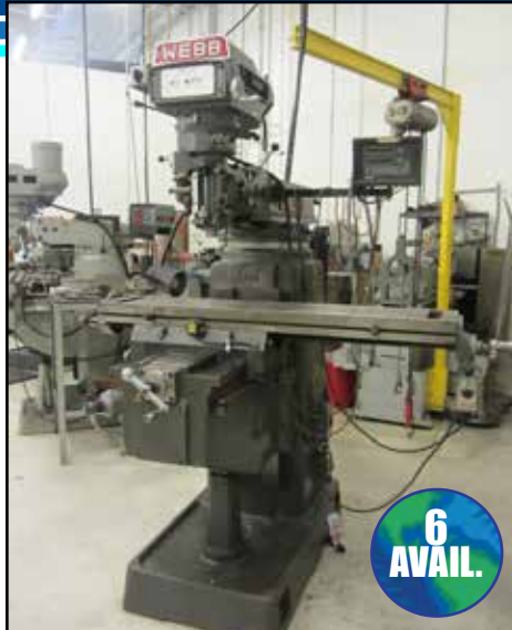
(1 OF 6) VARIABLE SPEED MILLING MACHINES