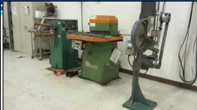
ASSORTED FABRICATING MACHINERY