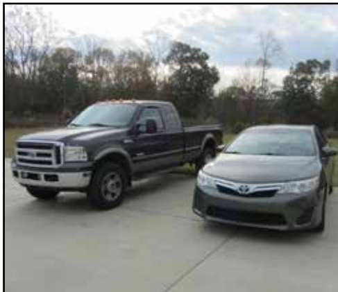
FORD F350 LARIAT SUPER DUTY PICK-UP TRUCK & TOYOTA CAMRY

Want to Sell Your Shop or Know Someone Who Does? Call Us Toll Free at (888) 800-4442! We Pay Great Finder's Fees!