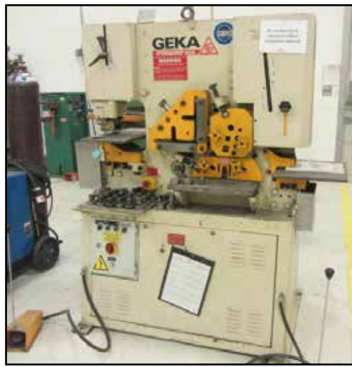
GEKA HYDRACROP 50/A 50 TON HYDRAULIC IRONWORKER

Download a lot book at www.asset-sales.com