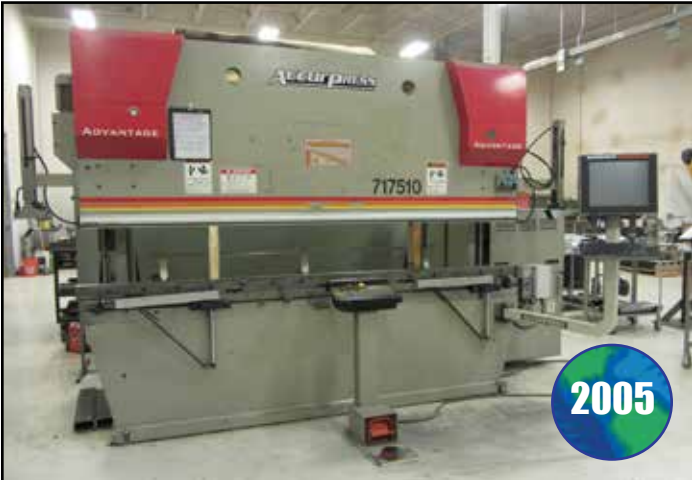
ACCURPRESS ADVANTAGE 175 TON X 10' 3-AXIS CNC HYDRAULIC PRESS BRAKE

MAZAK 4000 Watt CNC Laser Model Super Turbo X510 MARK II with 5' x 10' Work Table, ORION Chiller, Dust Collector & MAZATROL CNC Control, sn:181893, mfg.2005 (Refurbished 12/2017 by MG Laser) Hour Meter Shows Approximately 25014 Total