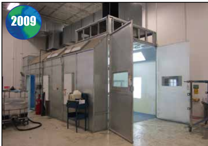
26'W X 14'D X 10'6"H DOUBLE DOOR PAINT BOOTH