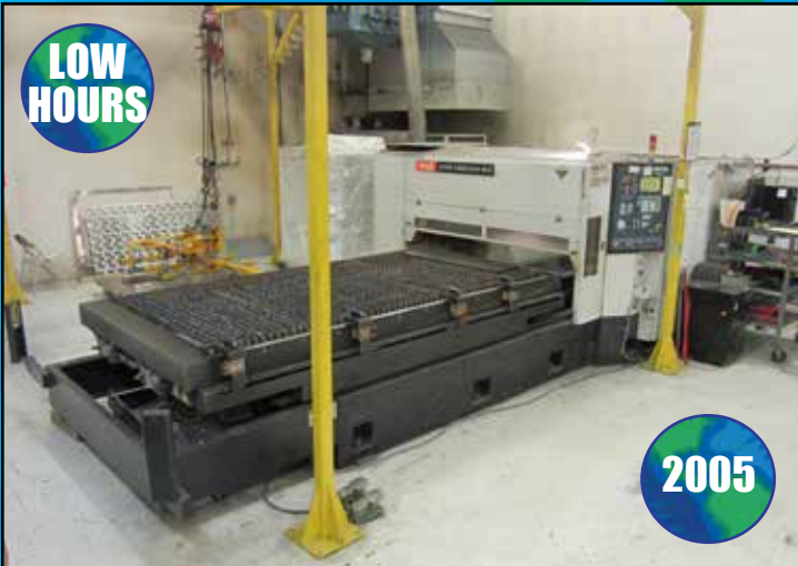
MAZAK SUPER TURBO-X510 MARK II