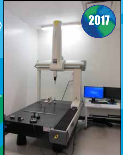
BROWN & SHARPE GLOBAL COORDINATE MEASURING MACHINE