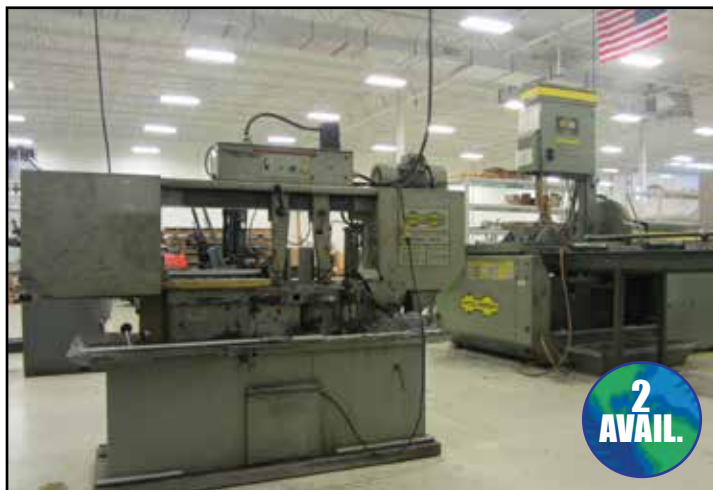
(2) HYD-MECH BANDSAWS