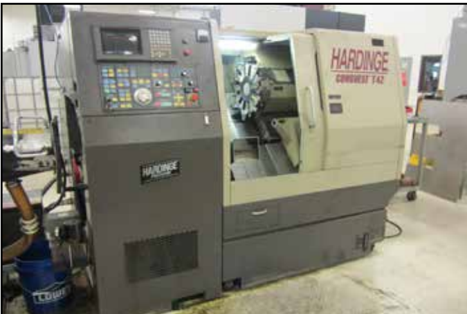
HARDINGE CONQUEST T42 CNC TURNING CENTER