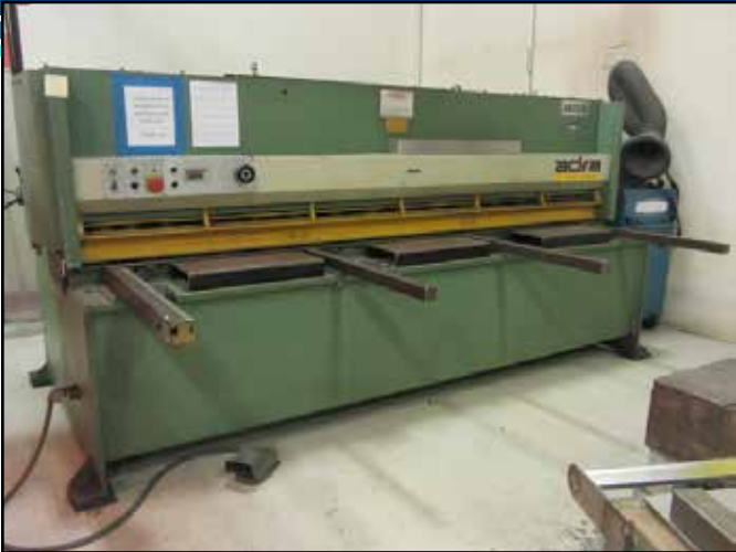
ADIRA 10' X 1/4" HYDRAULIC SQUARING SHEAR