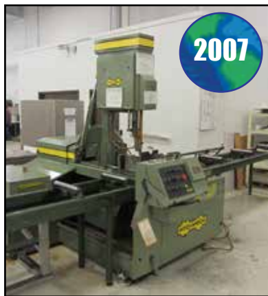
HYD-MECH V18II TILT FRAME VERTICAL BANDSAW