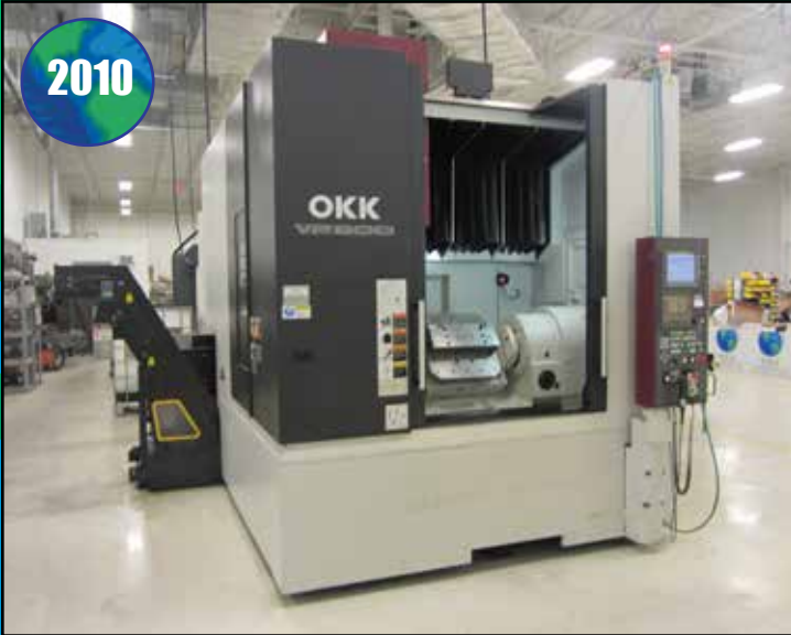
OKK VP 600 5-AXIS VERTICAL MACHINING CENTER

THURSDAY, DECEMBER 6TH @ 10:00 A.M. EST Inspection: Wednesday, December 5th, 8:00 AM - 4:00 PM EST