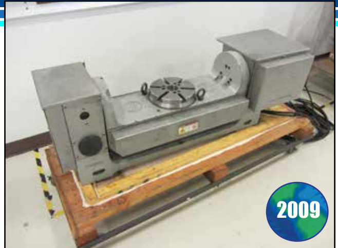
HAAS TR-210 4/5 AXIS ROTARY TRUNNION TABLE