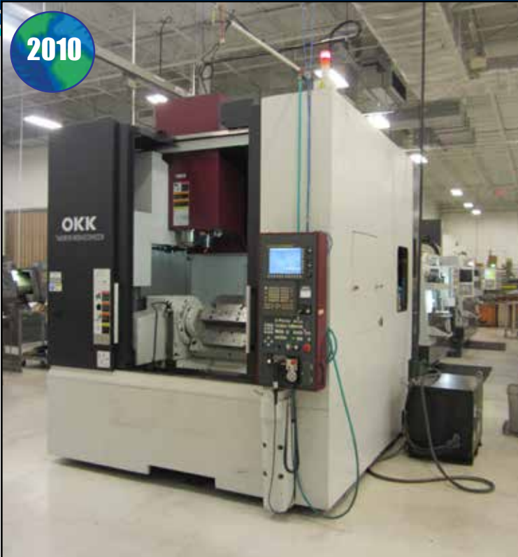
OKK VP-600 5-AXIS CNC VERTICAL MACHINING CENTER