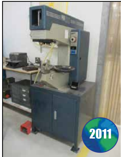
PEMSERTER SERIES 4 6-TON INSERTION PRESS